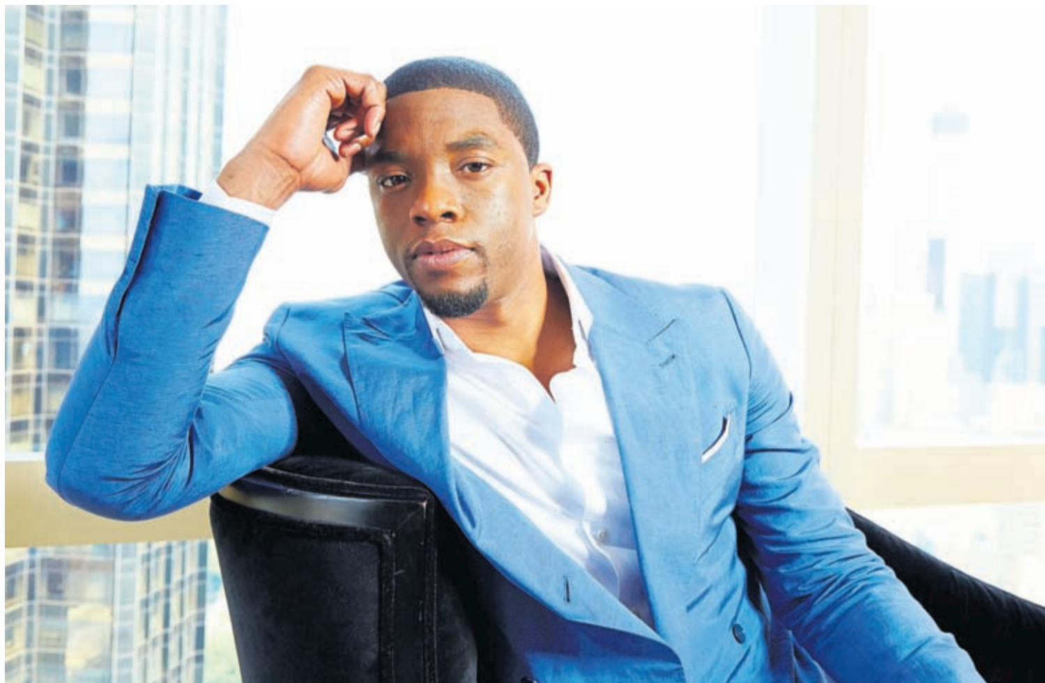
This July 21, 2014 file photo shows actor Chadwick Boseman posing for a portrait in New York.

"These are pillars in our community," Rev. Al Sharpton said. "In times of instability, you depend on pillars. It's bad enough when there's a storm outside and you hear the lightning and thunder. It gets worse when the pillars that you're building and standing on (are) shaking. It's like they're chipping away at our foundation. The very building is shaking down, because the things that undergird and protect us from the storms are being removed." Sharpton called Boseman an important pillar that humanized several Black historical trailblazers in his roles — including color-line breaking baseball star Jackie Robinson, legendary singer James Brown and the first African American